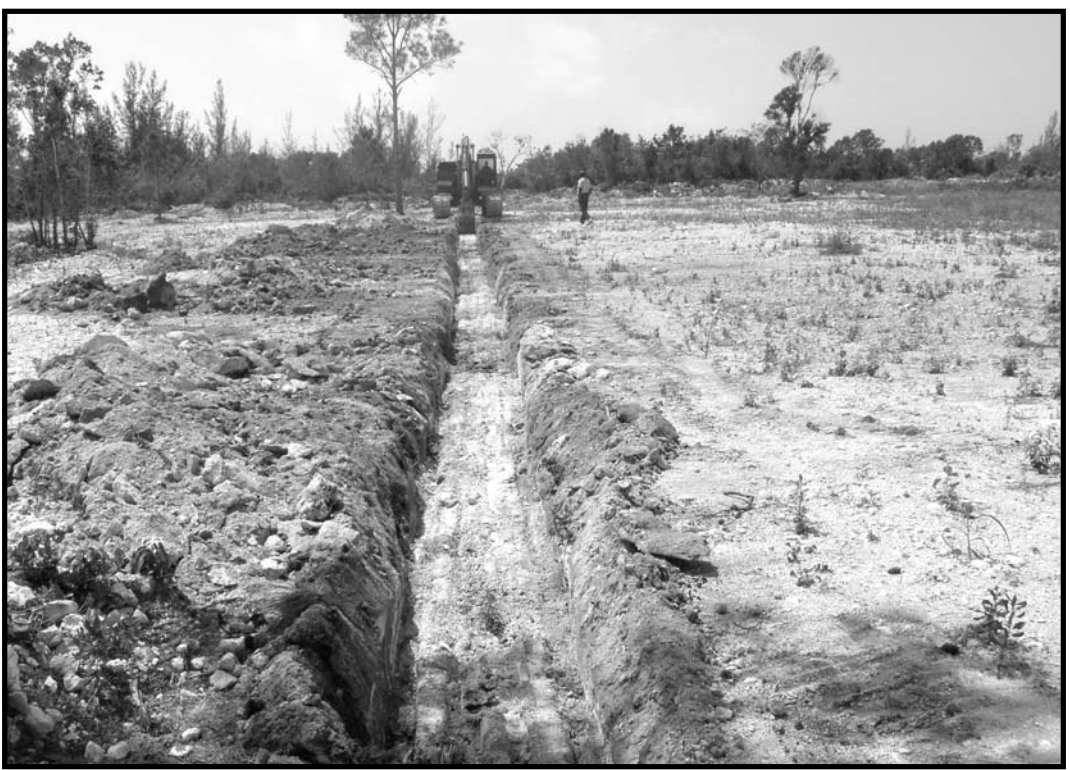
The Bahamas Academy Secondary Division foundation is on its way. On Tuesday, April 26, 2005, workmen began cutting the footing for the multi-million dollar new complex for Adventist education in Nassau.